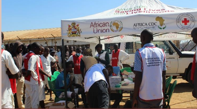
The campaign led by the Malawi Red Cross Society and