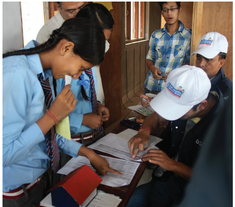
Young Chetansil Yuwa Bachat Yojana accountholders make deposits into their savings accounts during an in-school banking visit in Bhaktapur, Nepal.

Youth savings is a relatively new trend in financial services, particularly in low-income countries, and one that remains in experimental stages. It is our hope that this paper will similarly inform others who wish to provide or support the provision of youth savings services, in order to contribute to the financial services industry's expertise and commitment to serving low-income young people.