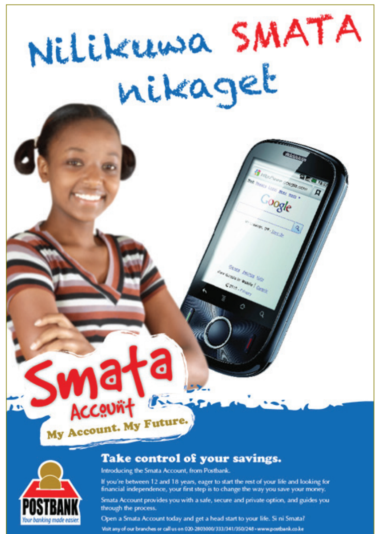
Promotional poster for Kenya Postbank's SMATA account.

Ongoing involvement by the cross-functional pilot test team was another mechanism critical to producing institutional alignment around the new youth products. Many pilot test team members had been involved right from the product design