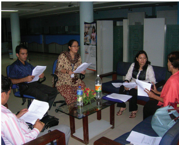
Staff at Bank of Kathmandu's Gongabu branch participate in a training on the new Chetansil Yuwa Bachat Yojana account.

Savings have been associated with better mental health, educational attainment, and less-risky sexual attitudes and behaviors.