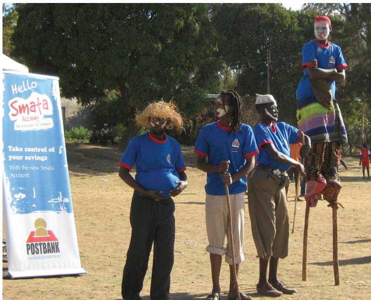
Entertainers at a community activation event in Kitui, for Kenya Postbank’s SMATA account.

Such marketing took place through “activation” events (community events with games and entertainment), school presentations, street theater, and in conjunction with financial education conducted by Save the Children. These activities often included opportunities to open accounts on the spot, and sometimes to conduct transactions. However, the success of these activities in terms of achieving uptake was often determined by the presence of the trusted adult needed to co-sign on the account. In Kenya, for example, the most successful single event in terms of account opening was a community fair, at which one branch opened more accounts than at any of the activation events organized specifi-