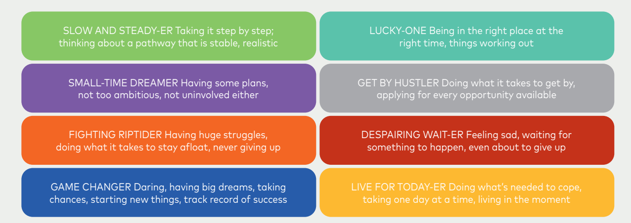
Figure 2: Typologies of action and ambition

selves (their own levels of agency), as well as their aspirations for their future selves. Figure 2 sets out the descriptions of these typologies.